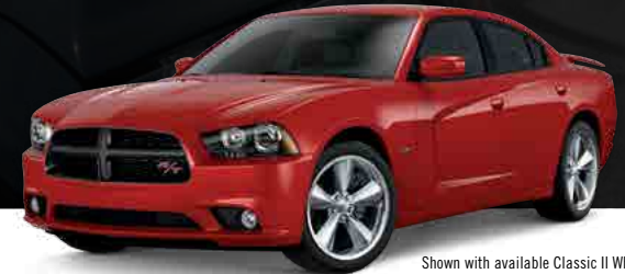
Shown with available Classic II Wheels