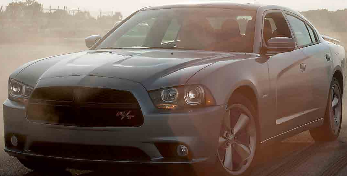
Charger R/T Road & Track shown in Granite Crystal Metallic with available Black roof and 20-inch polished forged aluminum Classic II wheels.