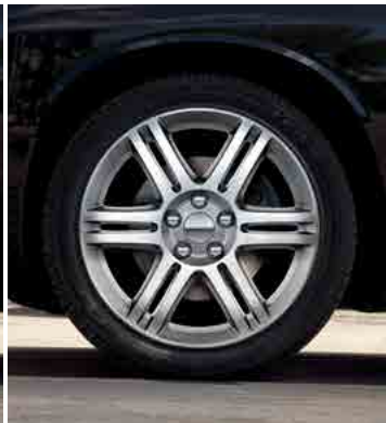
18-inch polished aluminum (standard on R/T, optional on SXT)