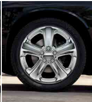
18-inch chrome-clad aluminum (standard on SXT Plus and R/T Plus, included in Sport Appearance Group on SE and SXT)