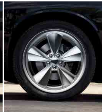
20-inch Classic II polished forged aluminum (optional on R/T Road & Track and Rallye Appearance Group on SXT and SXT Plus)