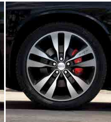
20-inch forged aluminum with polished face and Black pockets (standard on SRT)