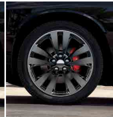
20-inch Black Vapor Chrome forged aluminum (optional on SRT)