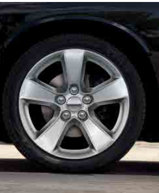
17-inch aluminum (standard on SE and SXT)