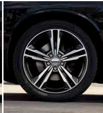
19-inch polished aluminum with Gloss Black Pockets (included in AWD Sport Appearance Package on SXT, SXT Plus, R/T and R/T Plus)