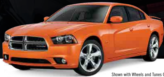
Shown with Wheels and Tunes Group