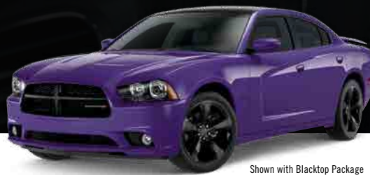
Shown with Blacktop Package