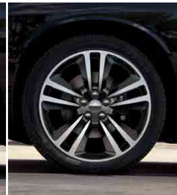
20-inch cast aluminum with Black pockets (standard on SRT® Super Bee)