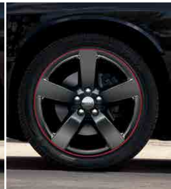
20-inch Black Chrome aluminum with Red lip/backbone (included in Redline Package on SXT and SXT Plus)