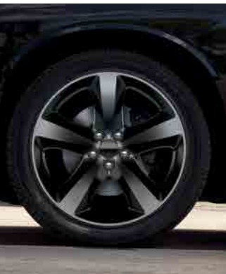
20-inch Gloss Black aluminum (included in Blacktop Package on SXT, SXT Plus, R/T and R/T Plus)