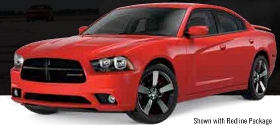
Shown with Redline Package