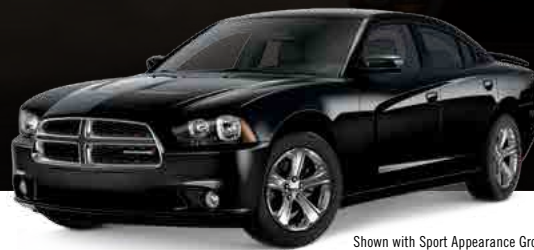
Shown with Sport Appearance Group