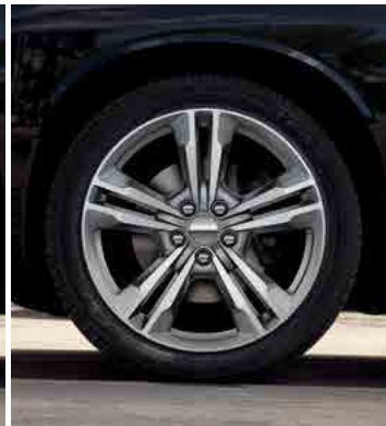
19-inch Satin Carbon aluminum (standard on all-wheel-drive [AWD] models)